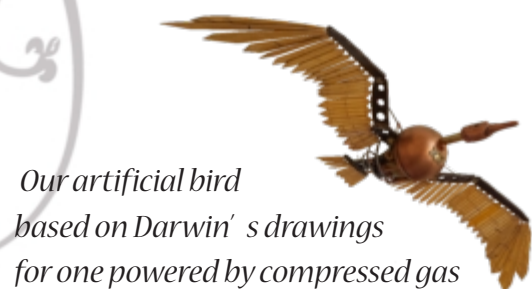
Our artificial bird based on Darwin's drawings for one powered by compressed gas

By becoming a Friend you can play an important part in commemorating this great man who lived in Darwin House from 1758 - 1781.