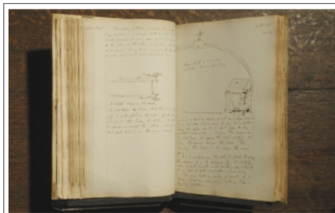
Dr Darwin's original Commonplace Book